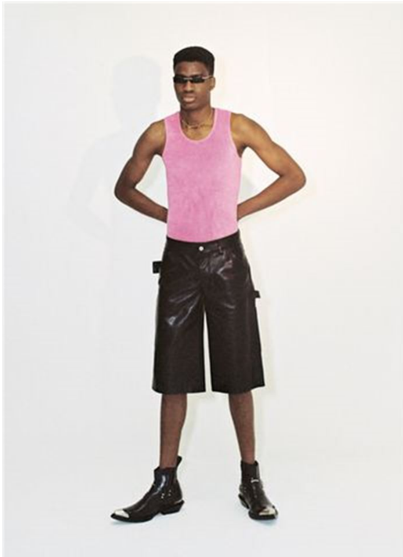
Previous left: All clothing Alexander McQueen