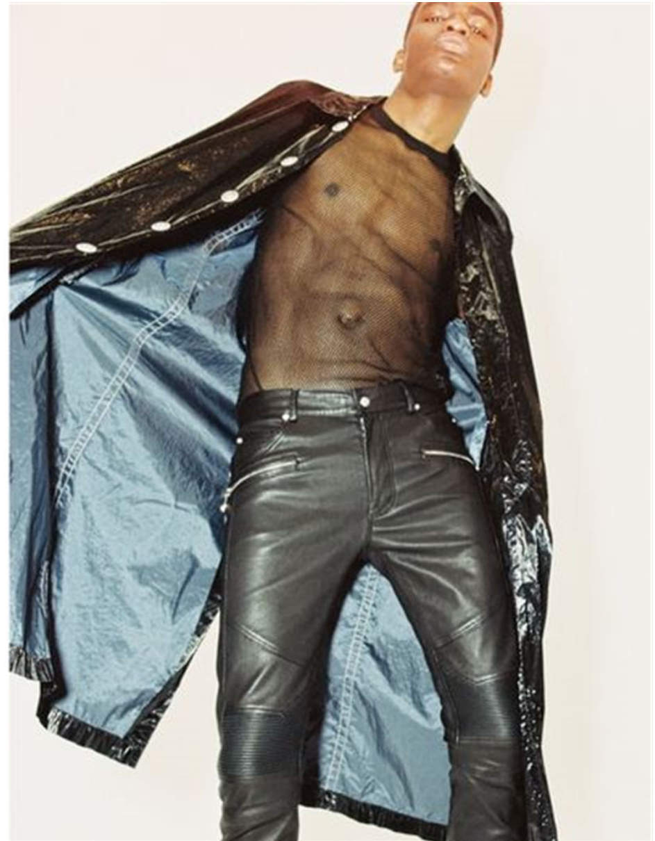
This page: Top Balenciaga, shorts Balenciaga, longcoat Andy Wolf, necklace and boots Balenciaga Opposite page: Oscar De la Renta, shirt De la Renta, trousers Balenciaga