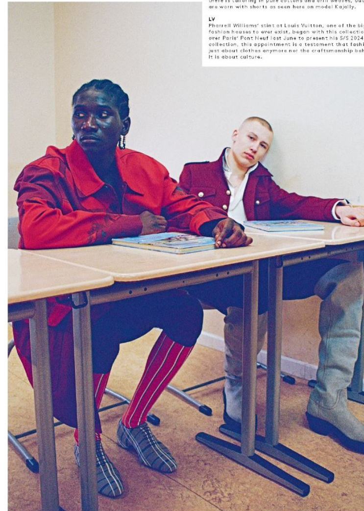
LV Pharrell Williams' stint at Louis Vuitton, one of the biggest fashion houses to ever exist, began with this collection. Taking over Paris' Pont Neuf last June to present his S/S 2024 men's wear collection, this appointment is a testament that fashion is not just about clothes anymore nor the craftsmanship behind them. It is about culture.