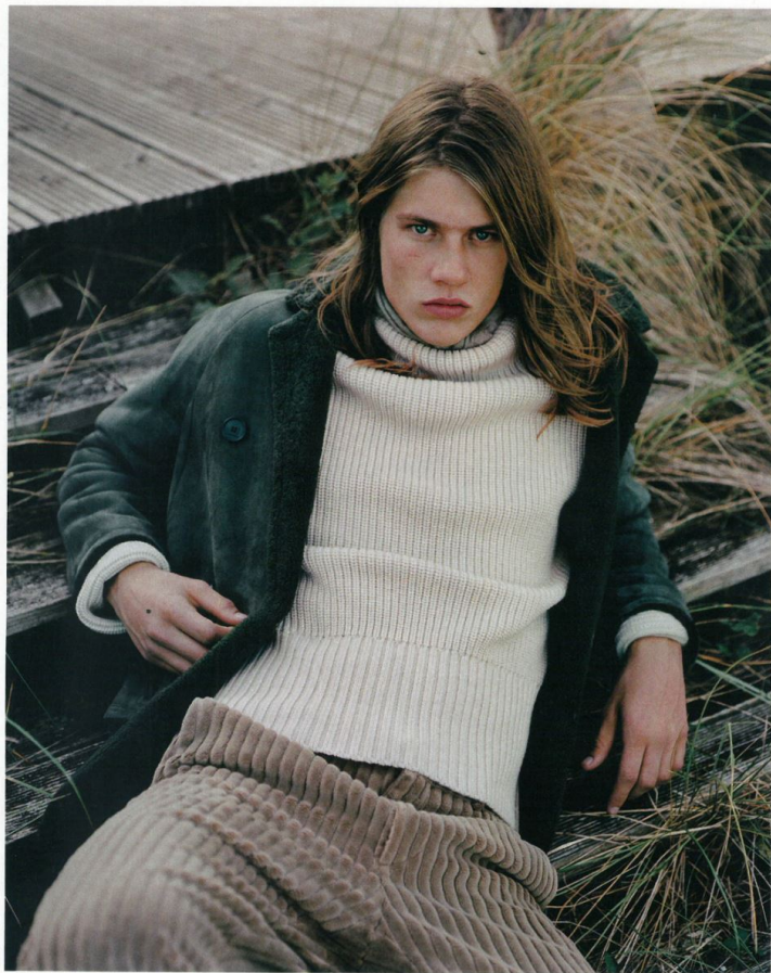
Coat, sweater, and scarf by Canali. Pants by Fendi.