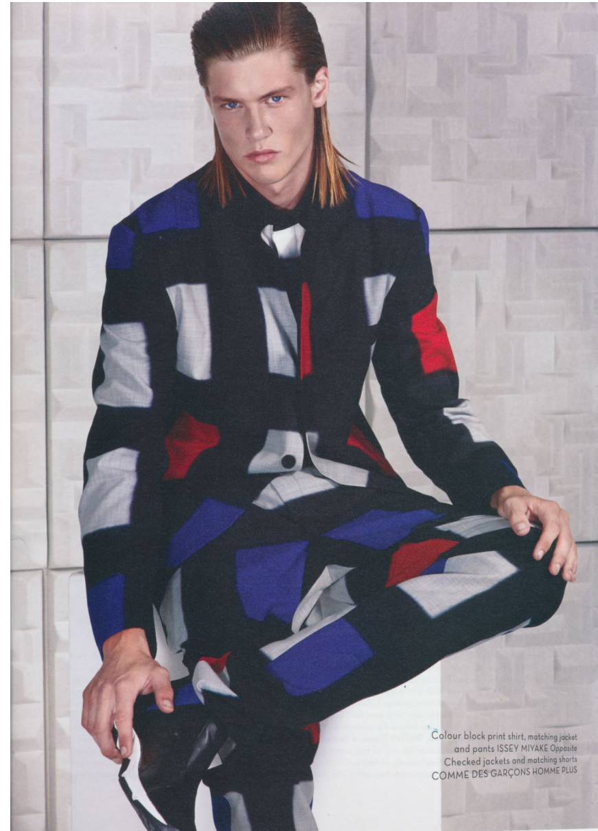
Colour block print shirt, matching jacket and pants ISSEY MIYAKE Opposite Checked jackets and matching shorts COMME DES GARÇONS HOMME PLUS