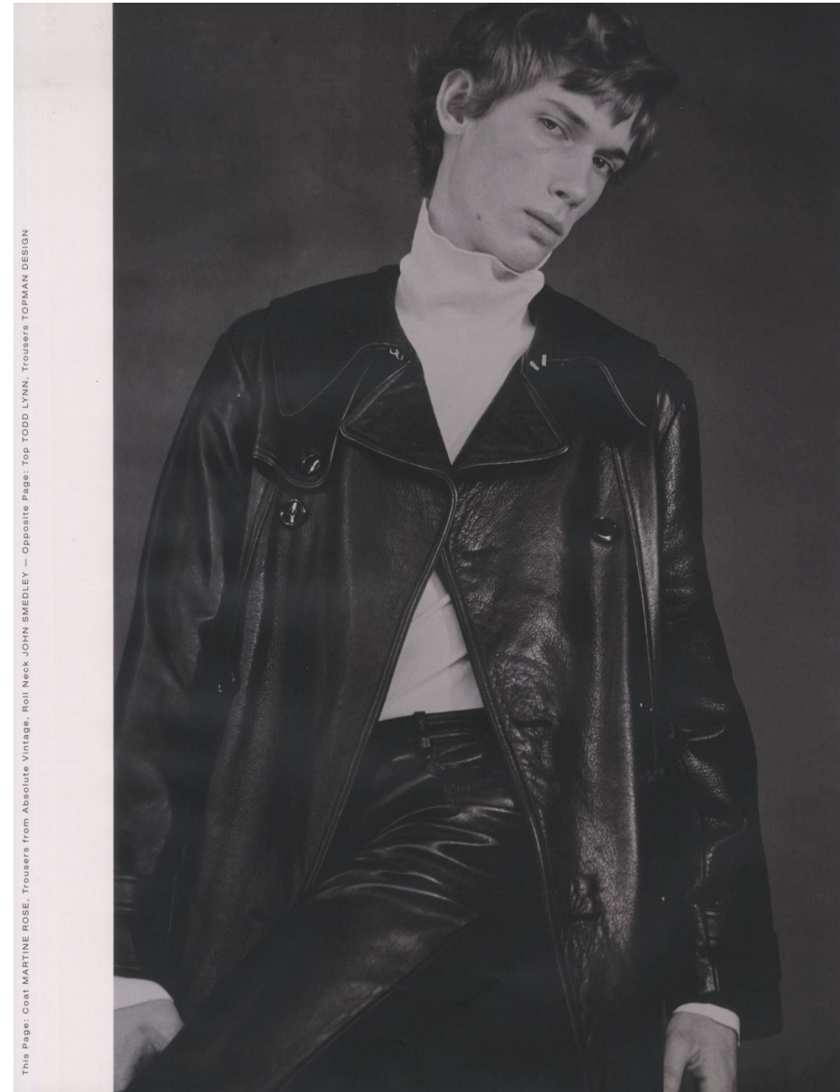
This Page: Coat MARTINE ROSE, Trousers from Absolute Vintage. Roll Neck JOHN SMEDLEY — Opposite Page: Top TODD LYNN, Trousers TOPMAN DESIGN