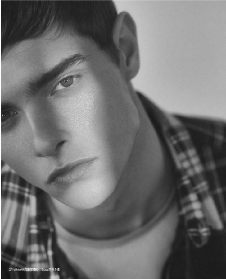
Off-White 格纹图案衬衫 / Boss 白色T恤