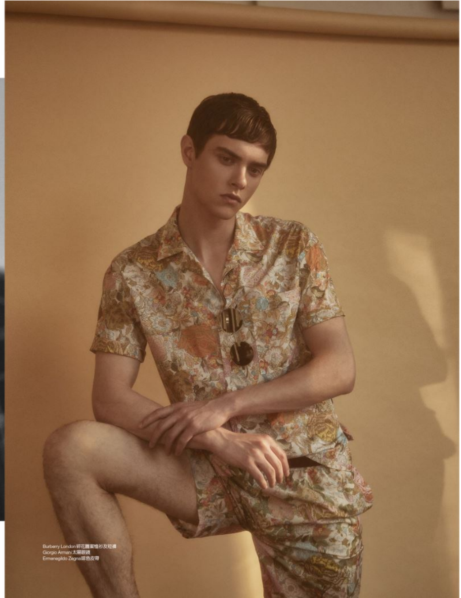
Burberry London 碎花图案衬衫及短裤 Giorgio Armani 太阳镜 Ermenegildo Zegna 绿色皮带