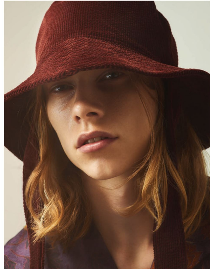
shirt and hat by DAMIR DOMA