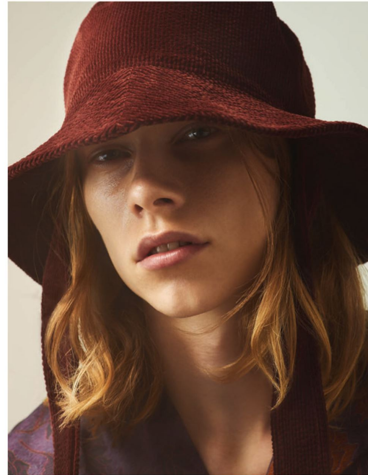
shirt and hat by DAMIR DOMA