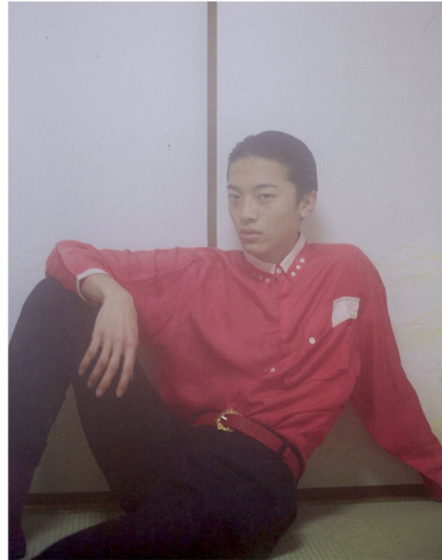
Black wool flannel pleated trousers Hermès A/W 2018, red call leather belt Kenzo A/W 2018, vintage shirt Kansai Yamamoto