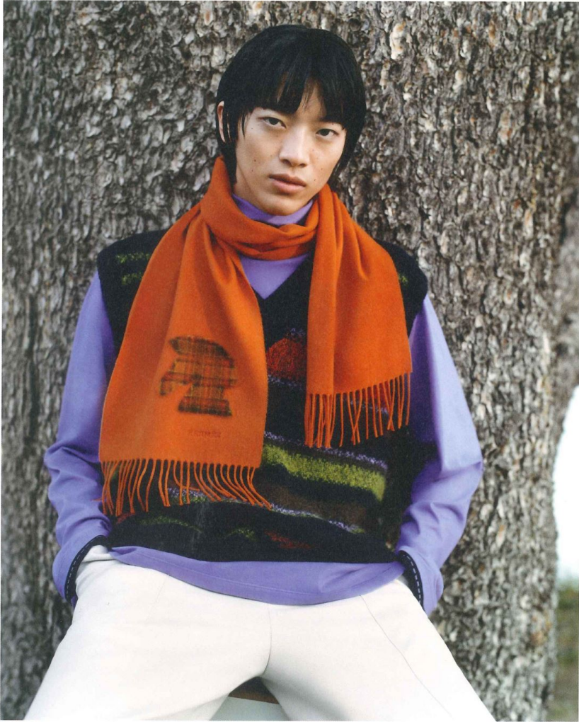
Akito indossa una sciarpa 25x150 cm in cachemire ricamato con lana.