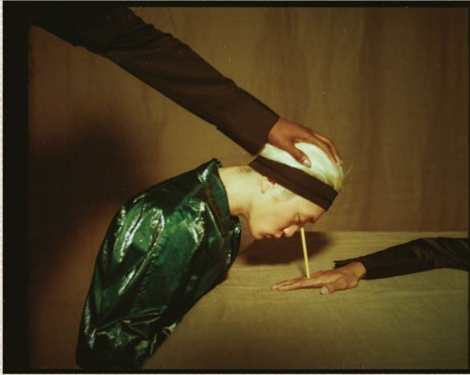
Dries Van Noten 绿色外套