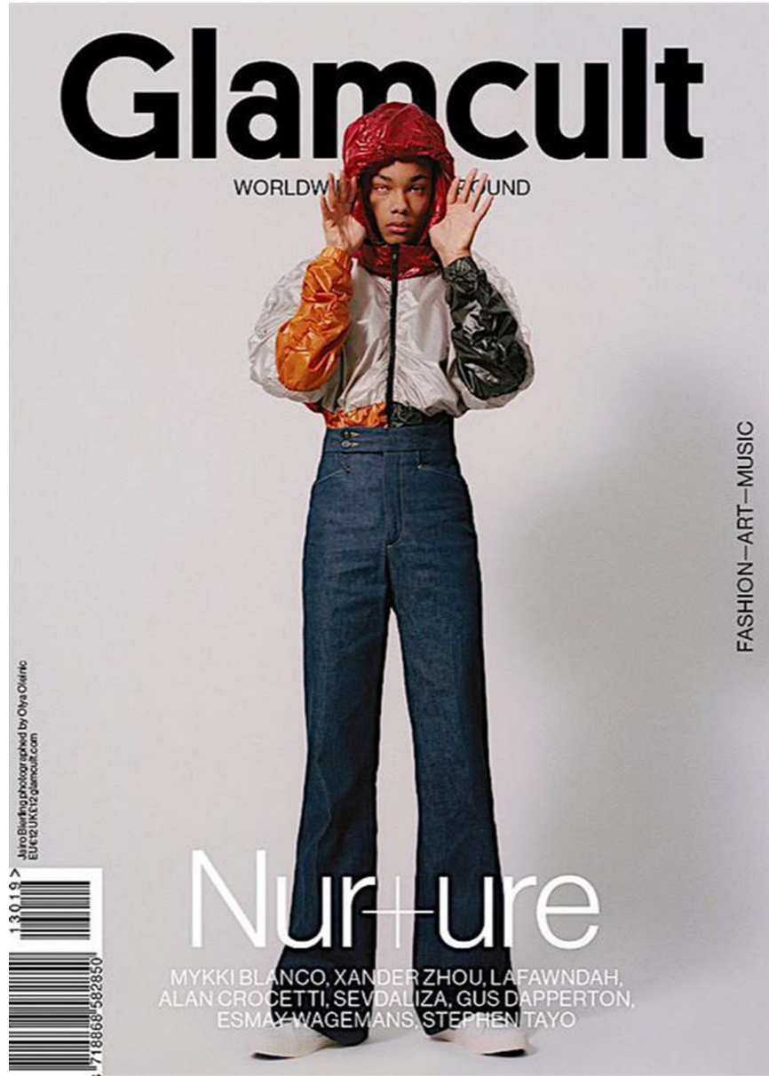
A BOY AND HIS MA