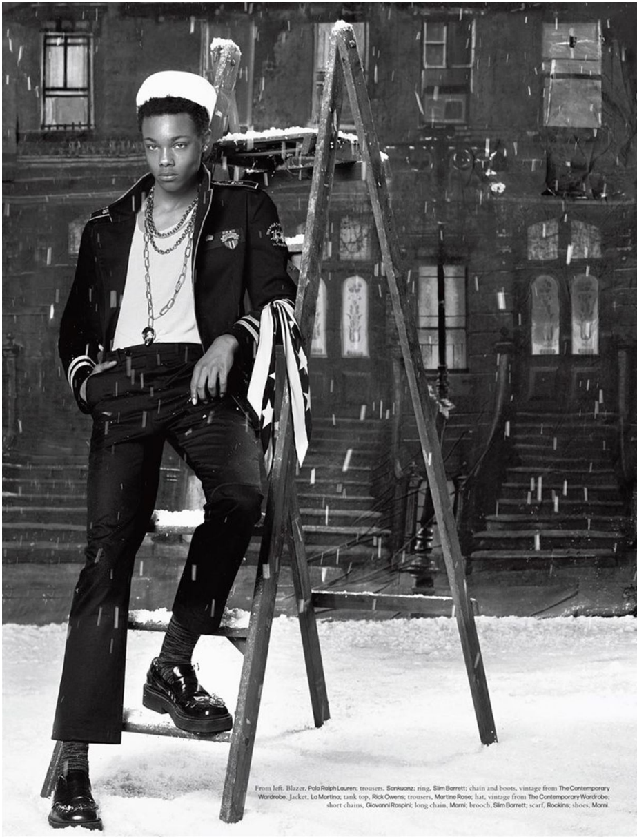
From left: Blazer, Polo Ralph Lauren; trousers, Sonkuanz; ring, Slim Barrett; chain and boots, vintage from The Contemporary Wardrobe. Jacket, La Martina; tank top, Rick Owens; trousers, Martine Rose; hat, vintage from The Contemporary Wardrobe; short chains, Giovanni Raspini; long chain, Marni; brooch, Slim Barrett; scarf, Rockins; shoes, Marni.