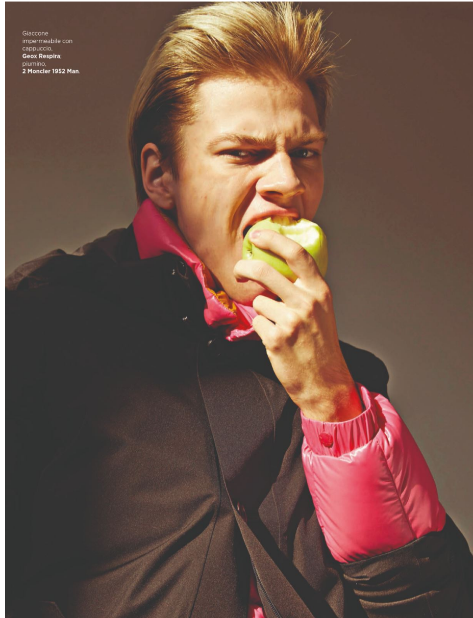
Giaccone impermeabile con cappuccio. Geox Respira : piumino, 2 Moncler 1952 Man .