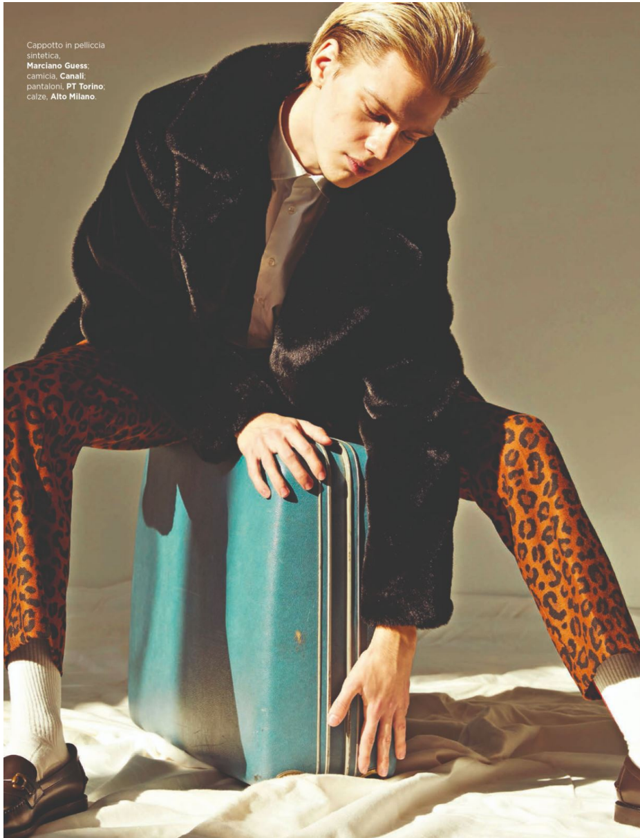
Cappotto in pelliccia sintetica. Marciano Guess : camicia, Canali ; pantaloni, PT Torino ; calze, Alto Milano .