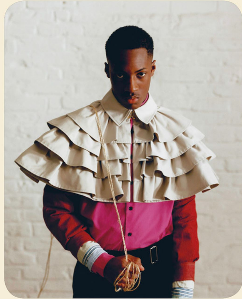
Shirts POLO RALPH LAUREN GIORGIO ARMANI and SIGNUM Cape BURBERRY Trousers DRIES VAN NOTEN