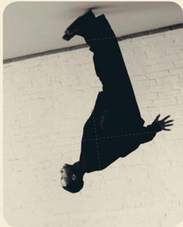
Shirt and trousers VALENTINO Shoes BOTTEGA VENETA