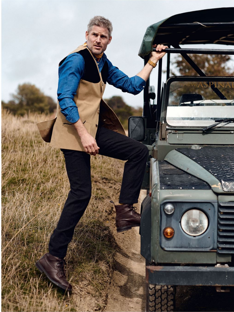
Khaki cotton vest with black-suede patch detail, £660, Holland & Holland; navy chambray shirt, £135, Daks; yellow silk neckerchief, £65, Turnbull & Asser; burgundy-and-brown seersucker trousers, £175, Daks; brown deerskin leather boots, £425, Tricker's; Black Bay Bronze (as before) ➤