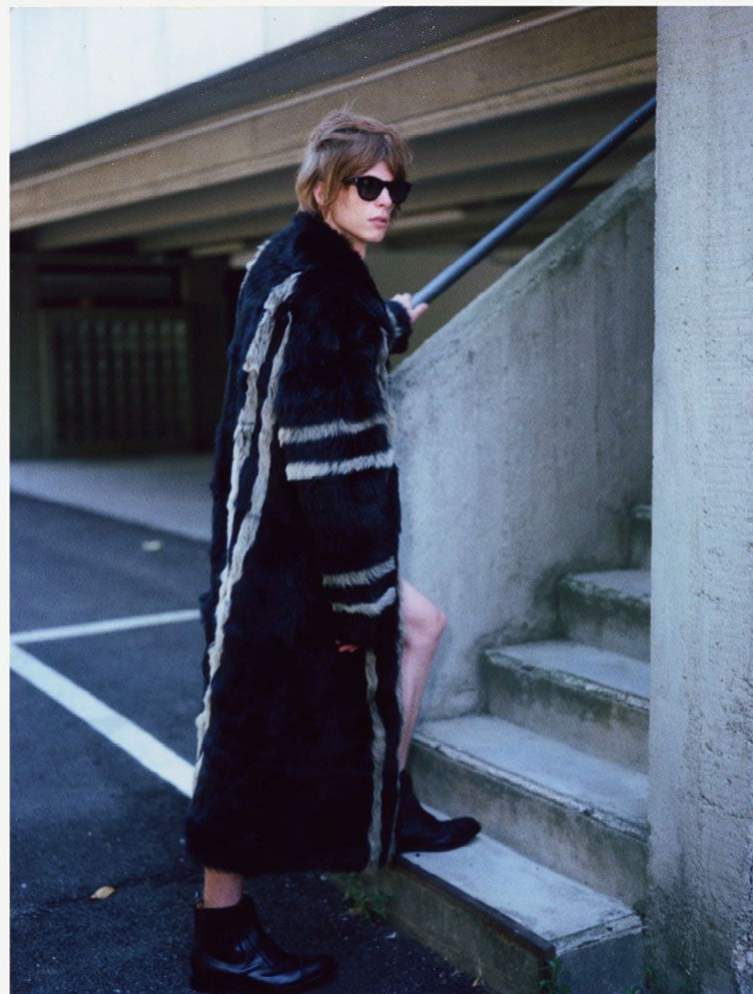
Fur PAUL SMITH - Sunglasses SAINT LAURENT BY HEDI SLIMANE - Boots GUGLIELMO CAPONE Opposite Page Shirt and Trousers GUCCI - Belt PAUL SMITH