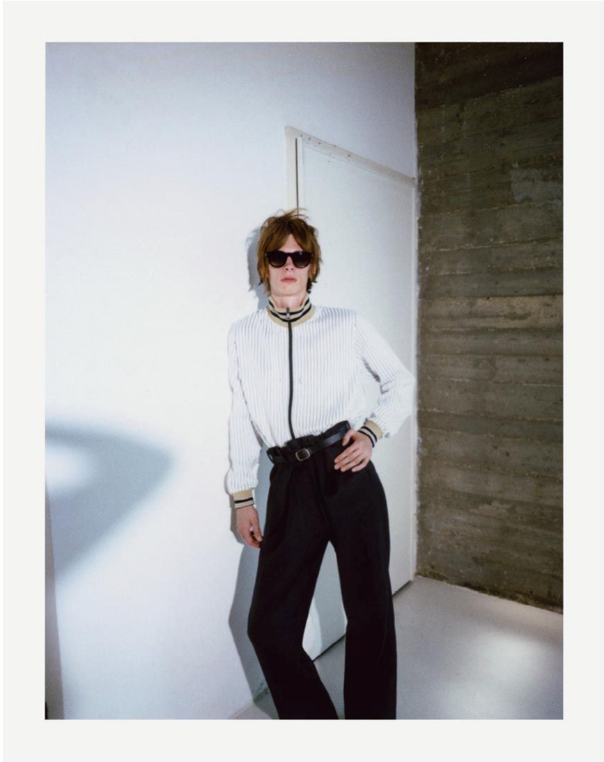
Jacket and Trousers JIL SANDER - Belt PAUL SMITH - Sunglasses SAINT LAURENT BY HEDI SLIMANE Opposite Page Shirt and Trousers LANVIN - Belt PAUL SMITH - Sunglasses SAINT LAURENT BY HEDI SLIMANE