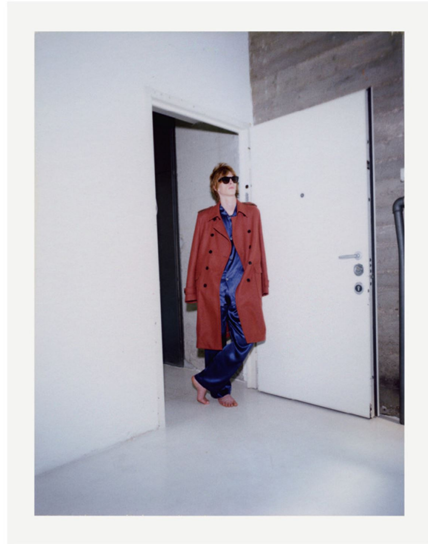
Trench BOSS - Pajamas BRIONI - Sunglasses SAINT LAURENT BY HEDI SLIMANE Opposite Page Sunglasses SAINT LAURENT BY HEDI SLIMANE