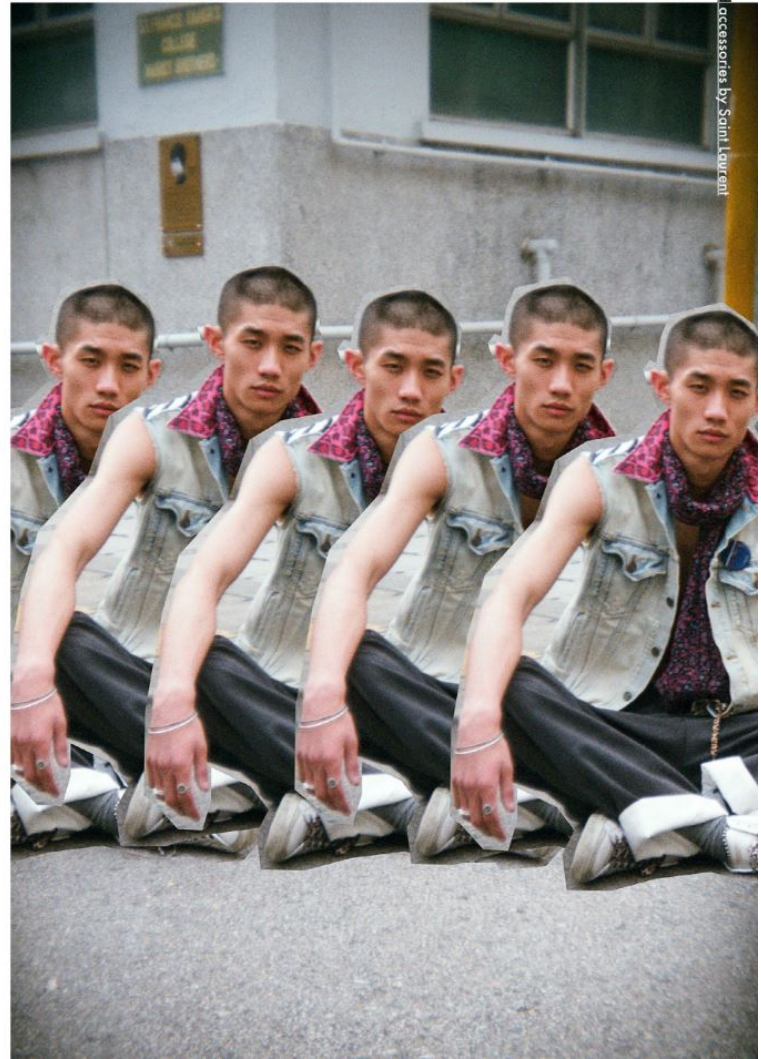
vest, scarf, shoes and accessories by Saint Laurent pant by Loewe