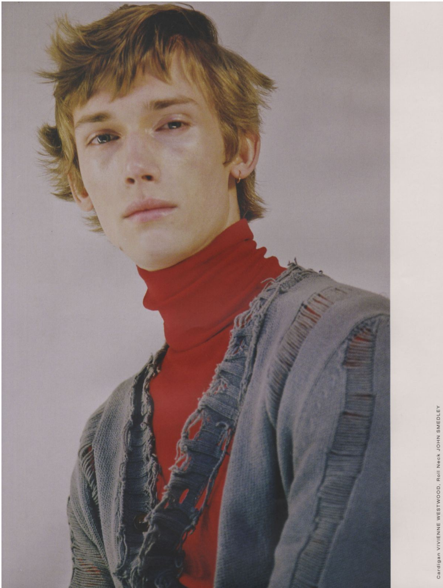
Cardigan VIVIENNE WESTWOOD, Roll Neck JOHN SMEDLEY